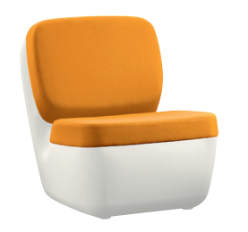
Shell: White 1736 C Cushions: Yellow F-576 (426)