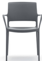
ARA 315 Read more >