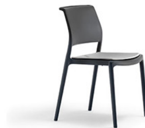
ARA cushion 310.3 Read more >