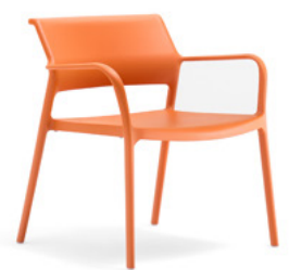
ARA lounge 316 Read more >