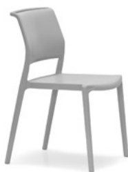
ARA 310 Read more >